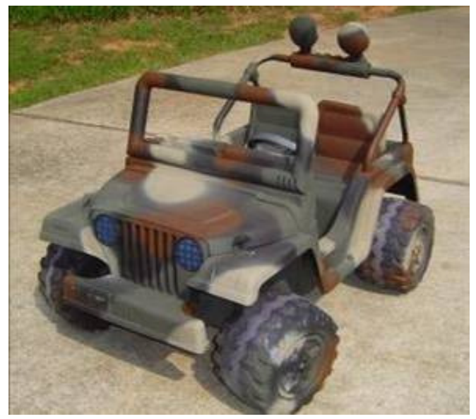
What every future off roader needs